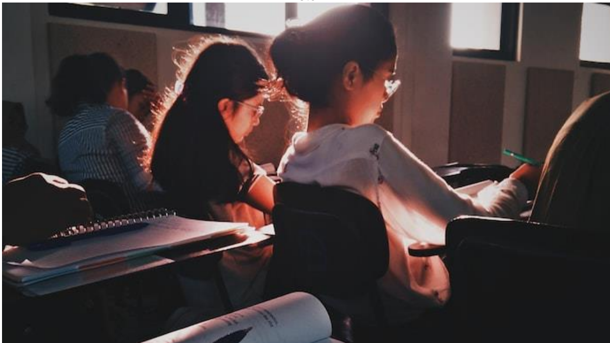
IIM Jammu to launch STEM programme for youth in J&K, Ladakh