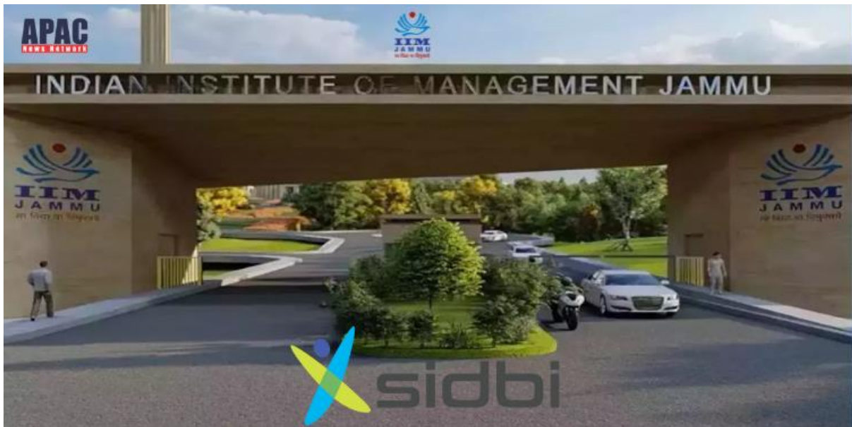
IIM Jammu, SIDBI collaborate to launch STEM program for entrepreneurial empowerment in J&K

in Education , Higher Education , News , Technology